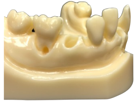
Ref. DM - 115-PI Price: 35,00 €