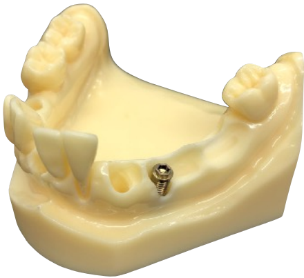
DM-115-PI-G With gingiva Price : 65,00 €