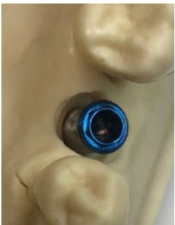
Ref. DM - 115-PI-2 Price: 35,00 €