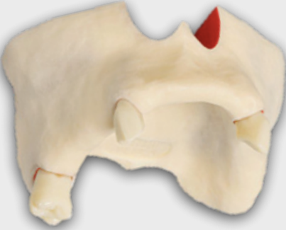
Ref. FRSM - 109 Sinus lift Parcial edentulous