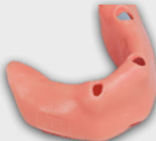
Ref. FRSM - 112 Gingiva reposition

Selmodels is the unique company worldwide manufacturing dental models with the four densities of bone : D1-D2-D3-D4 or manufacture customized densities according the design of the implants and needs