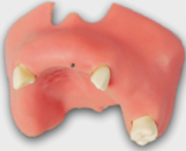
Ref. FRSM - 107 Sinus lift Parcial edentulous Gingiva

Our model material behaves similar to natural bone during drilling and cutting