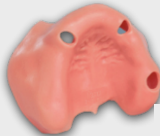
Ref. FRSM - 111 Gingiva reposition

Possibility to produce diferents densities in the same model upon request