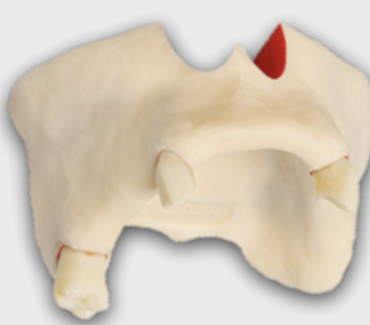
Ref. FRSM - 113 Sinus lift Total edentulous

Order the model with the bone density you need: